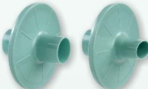
PBF-100 Patient side connection ISO-30 medical taper, Male